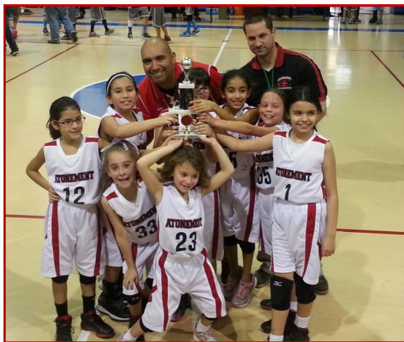
Congratulations 3rd gr girls: They earned 2nd place!

To register visit www.AtonementSports.com