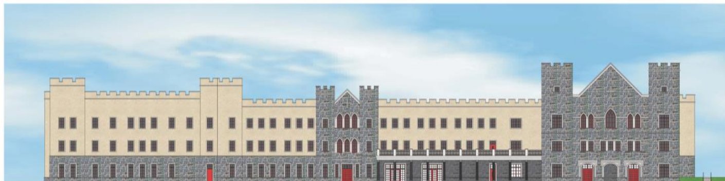
New Gym / Athletics Facilities